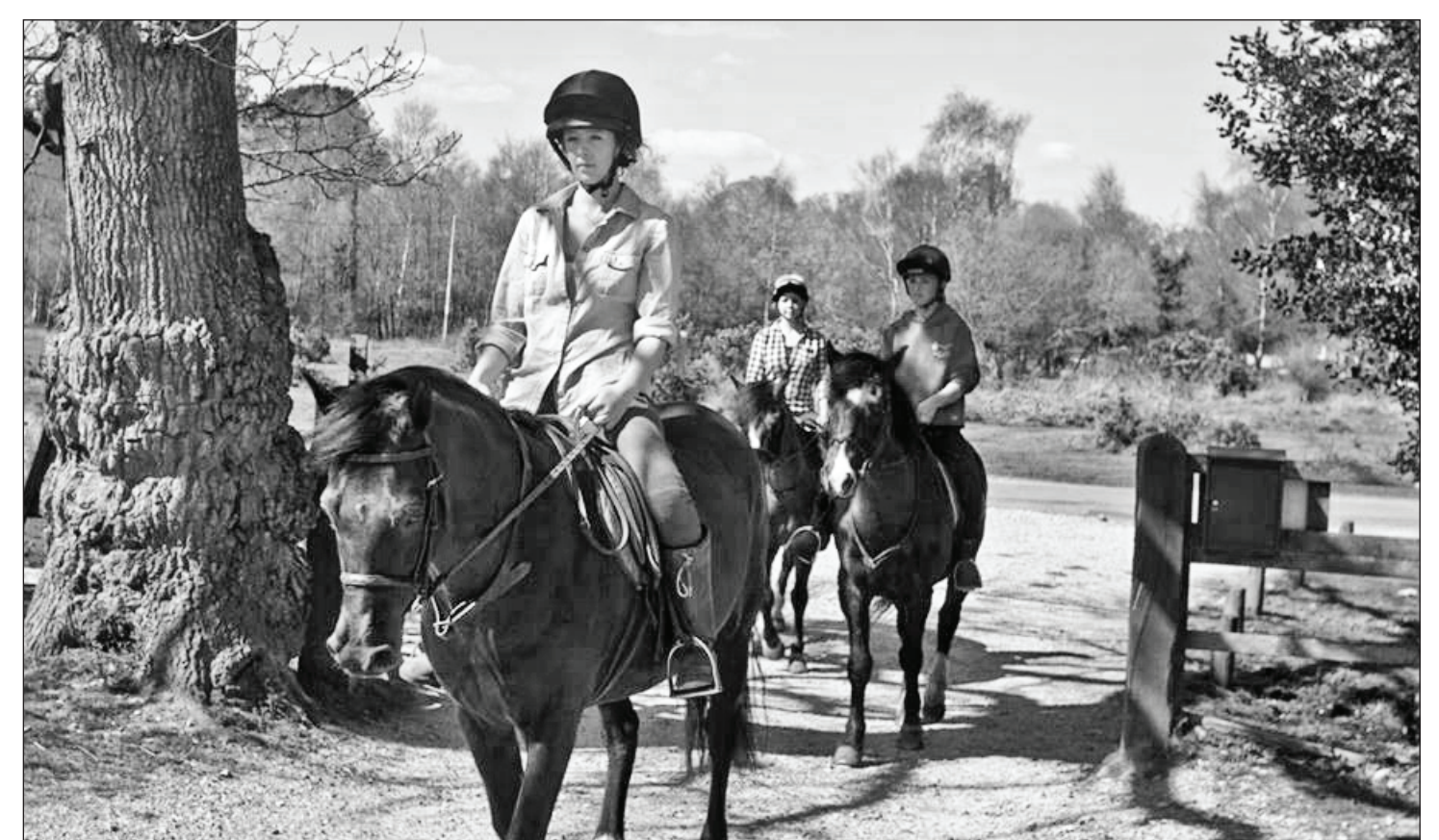
Clients at Ford Farm Stables returning from a Forest hack